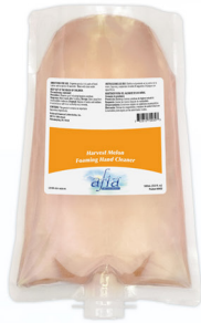
#0430-57 Harvest Melon Foaming Hand Cleaner 6 - 1000 mL / case