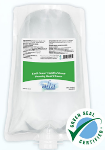
#0433-57 Earth Sense Certified Green Foaming Hand Cleaner 6 - 1000 mL / case