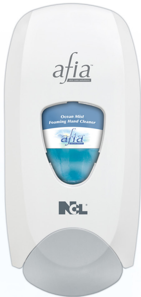
#4216 afia™ Manual White case qty 12