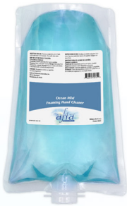
#0431-57 Ocean Mist Foaming Hand Cleaner 6 - 1000 mL / case