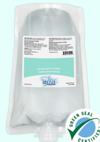
#0444-57 Hypoallergenic Certified Foaming Hand Cleaner ** 6 - 1000 mL / case