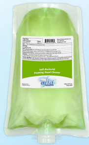
#0446-57 Anti-Bacterial Foaming Hand Cleaner (PCMX) 6 - 1000 mL / case