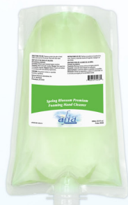
#0429-57 Spring Blossom Foaming Hand Cleaner 6 - 1000 mL / case