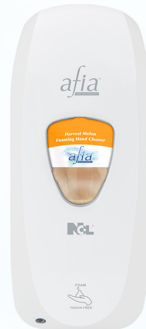
#4223 afia™ Touch Free White case qty 6