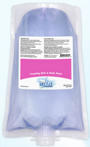
#0435-57 Foaming Hair & Body Wash 6 - 1000 mL / case

A study was conducted in accordance with the intent and purpose of Good Clinical Practice regulations.