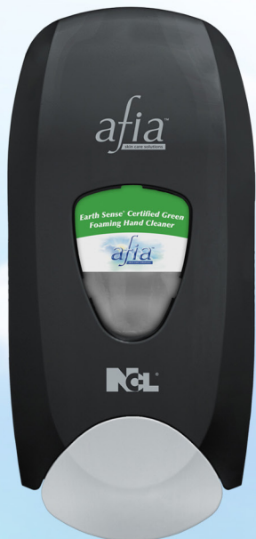
#4217 afia™ Manual Black case qty 12